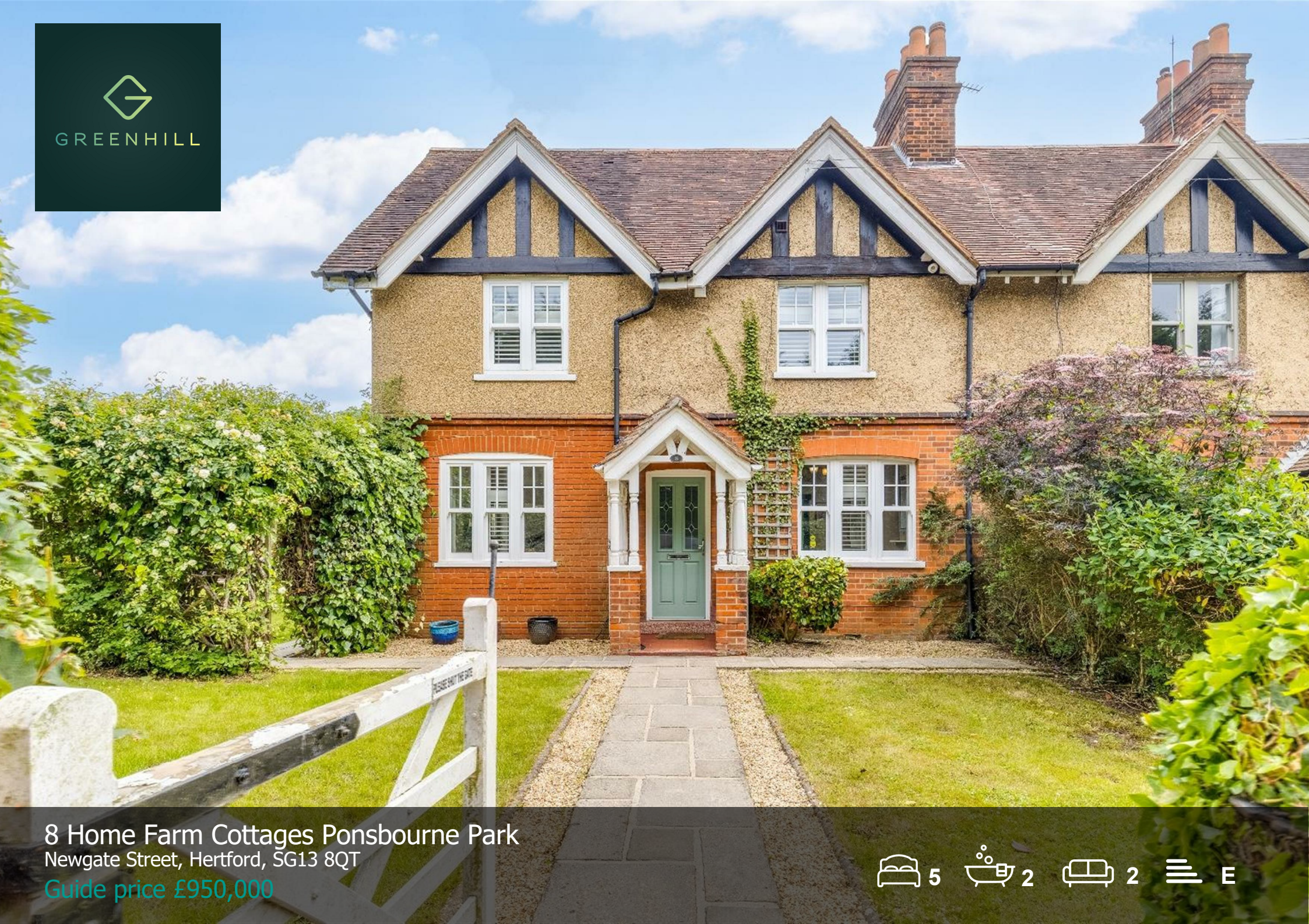
8 Home Farm Cottages Ponsbourne Park Newgate Street, Hertford, SG13 8QT Guide price £950,000